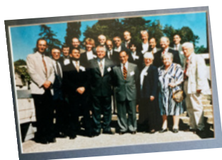
WHO working group 1997

Born 11 April 1755, James Parkinson is most famous for his essay ' An Essay on the Shaking Palsy ' in 1817, which first recognised Parkinson's as a medical condition.