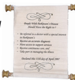
Photo of the Charter launched at the first WPD event in 1997

in May 1997. This led to the development of the first Global Declaration on Parkinson's Disease launched in Mumbai, India in December 2003 which aimed to encourage a change in attitude towards Parkinson's.